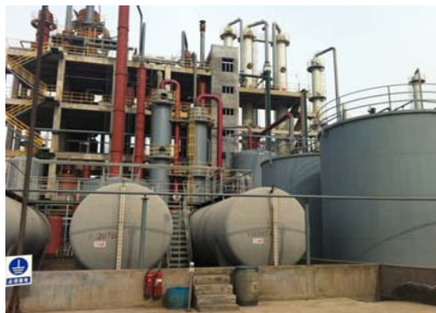
Blending & Mix